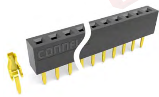
(Series Image-Reference Only)