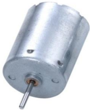
Weight: 52g (approx.)