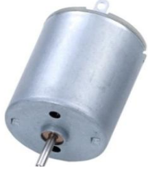
Weight: 42g (approx.)