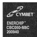
8 mm x 8 mm QFN SMT Package